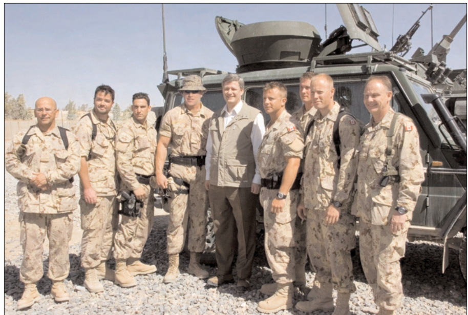
Afghanistan: The Prime Minister with a Military Mapper (on his left) and Military Engineers.