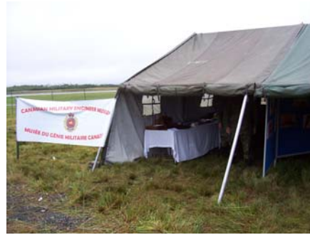
The Museum tent at Camp CANADA .